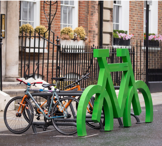
We have worked to enhance our green infrastructure, prioritising installations for pedestrians and cyclists