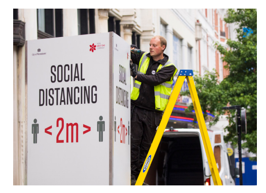
In partnership, New West End Company, Veolia & Westminster City Council installed hand sanitisation points, signage and ensured the streets were deep cleaned constantly throughout lockdown and during reopening