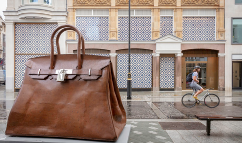
Left: This year's Oxford Street Christmas Lights were a "Love Letter to London" in partnership with Selfridges and celebrating #OurHeroes. Right: The Mayfair Sculpture Trail attracted thousands of visitors to explore the artwork over Summer.