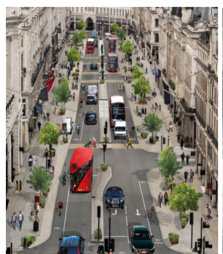
Improved greening, accessibility and pedestrian space delivered by The Crown Estate on Regent Sreet